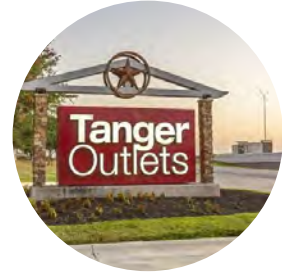
TANGER OUTLET MALL

830 606 1281 281 Gruene Rd, New Braunfels, TX