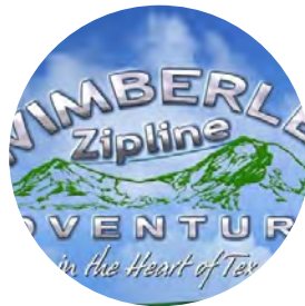
WIMBERLY ZIP LINING

830.629.9999 1405 Gruene Rd, New Braunfels, TX