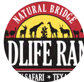
NATURAL BRIDGE WILDLIFE RANCH

512 847 9990 376 Winn Valley Dr., Wimberly, TX 78676